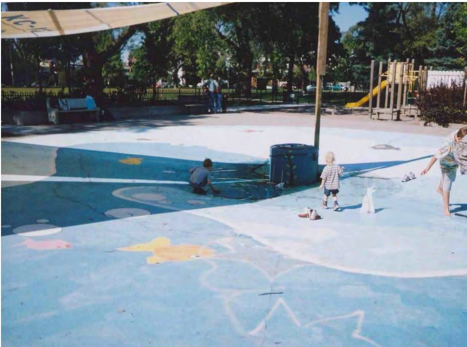
Sail Shade Canopy in Dovercourt Park Pilot Study – a low-cost, easily implemented model for temporary shade structures.