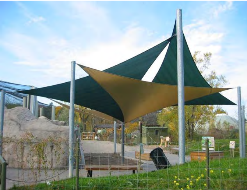
Example of constructed shade (shade sail) at the Toronto Zoo.