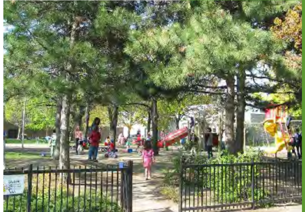
Example of natural shade over a playground in Seaton Village, Toronto.