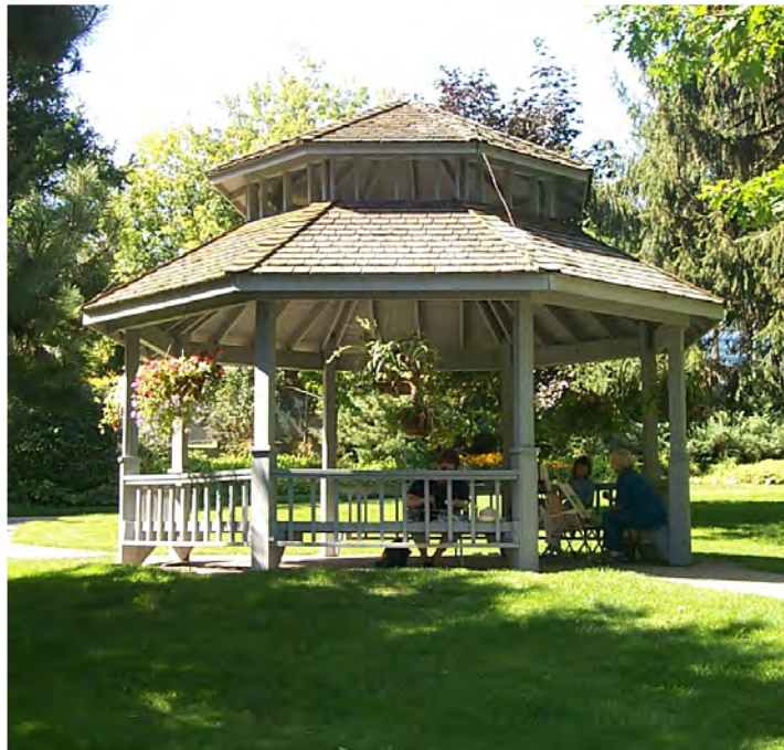
Example of constructed (gazebo) and natural shade working together.

A well constructed shade structure will result in shade that falls in the right places and at the right times of the day throughout the year, creates an outdoor space that is comfortable to use in all seasons, minimizes the impact of indirect UVR on the space, and is attractive, practical and environmentally friendly. Materials used should reduce reflectivity. The structures should be adequately sized, using barriers for side and overhead protection. Overhead barriers should be extended past the actual use area to provide optimal shade.