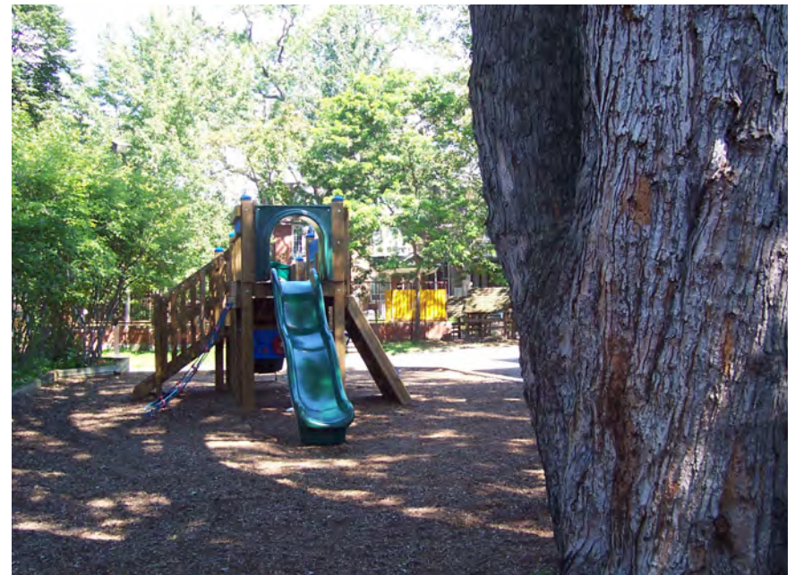
Example of natural shade at Garden Junior Public School – Toronto

In the interim, a set of principles has been identified to guide planning and decision-making in respective City agencies, boards, commissions and divisions (ABCDs). These principles are the foundation for the subsequent sections of this document which outline planning processes and tools for evaluating and implementing shade (See Section 7 – Planning for Shade) and provide guidelines for specific types of facilities and sites (Section 8 – Guidelines for Specific Sites).