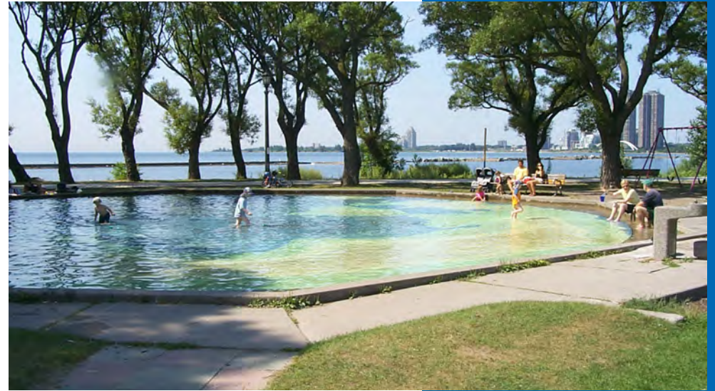
Example of natural shade at the Toronto waterfront.